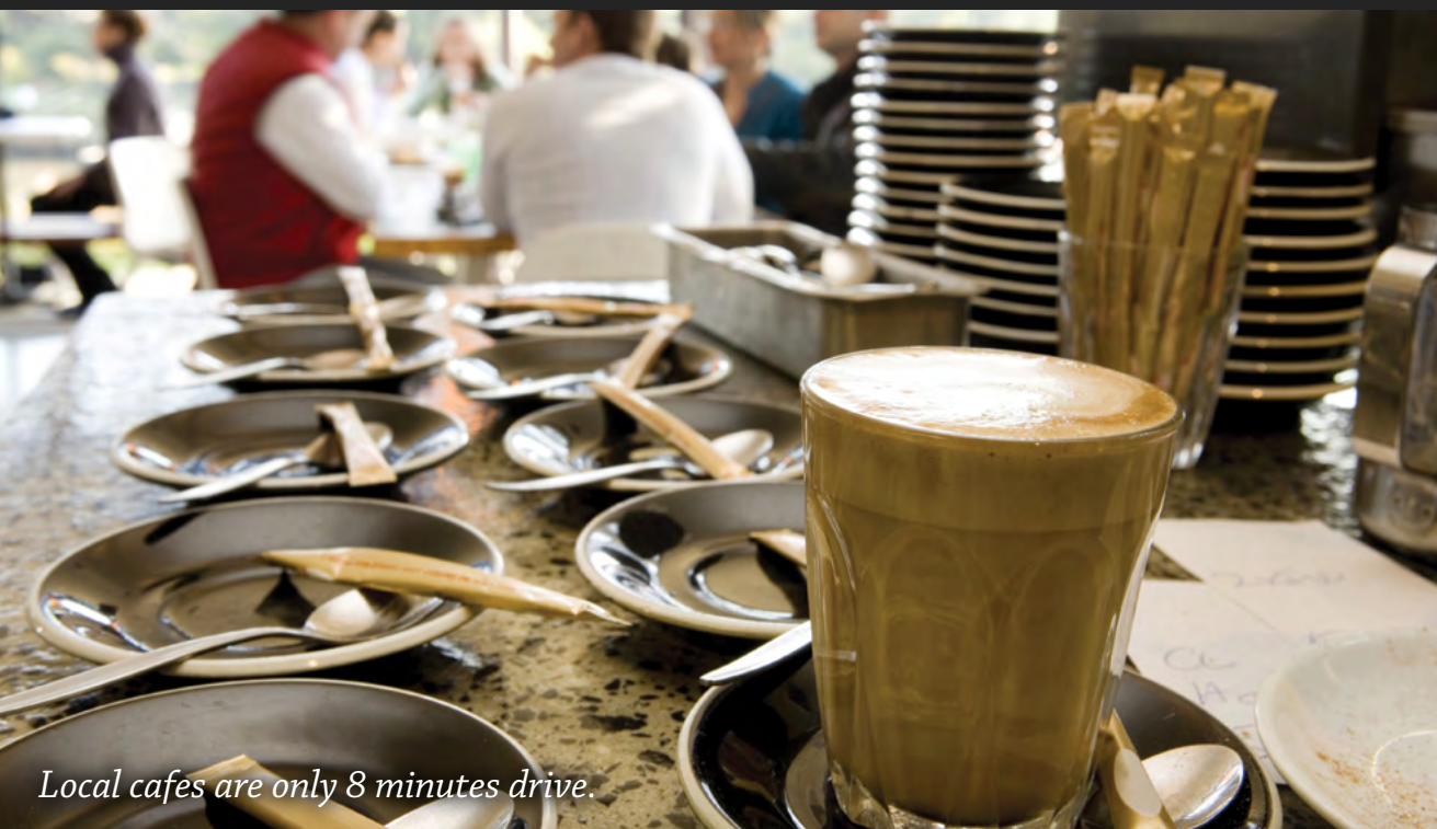
Local cafes are only 8 minutes drive.